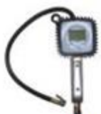
Digital air inflatable gun