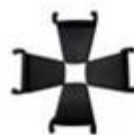
Plastic protection for clamp